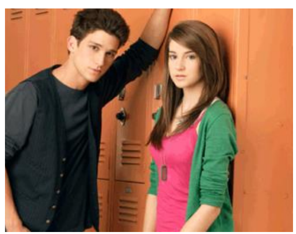
The Secret Life of an American Teenager